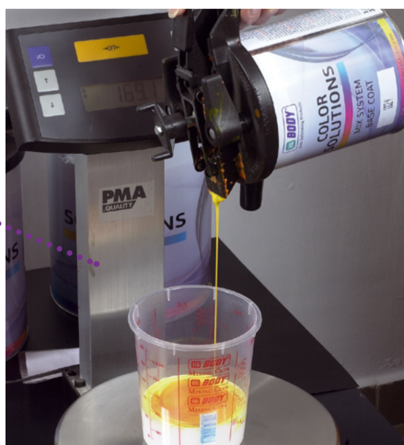
Mix the formula accordingly.