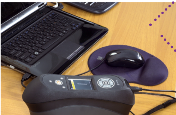
You can either connect the spectrophotometer on the computer by USB cable or you can use the Bluetooth technology.