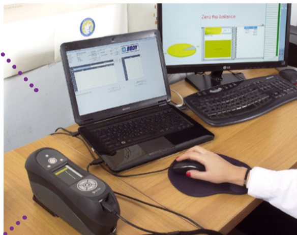
Upload the data taken to the CMS software in the particular order and rename if desirable.