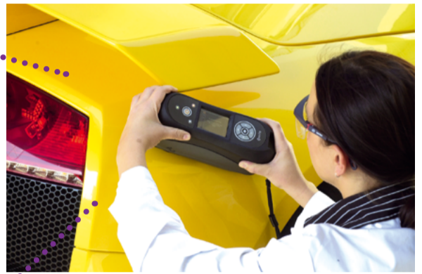
Firmly put pressure on the spectrophotometer till all light indications turn green. (not too much pressure will turn the sensors orange, too much pressure will turn the sensors red)